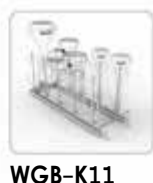
WGB-K11 Injection Module 10 injections For 500-2000ml Erlenmeyer flasks, volumetric flask, measuring cylinder & so on Injector nozzle: Ø6xH220mm H253xW140xD488mm