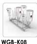
WGB-K08 Injection Module 8 injections For 500-2000ml Erlenmeyer flasks, volumetric flask, measuring cylinder & so on Injector nozzle: Ø6xH220mm H253xW140xD488mm