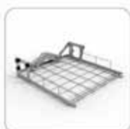
WGB-Z01 Upper level basket frame With two connectors, Used to connect 2 injector inserts Auto self-sealing docking valve H140, W536, D562mm