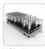
WGB-K80 Injection Module 84 injections For 84pcs glass tubes, centrifuge tube, test tubes & so on. Injector nozzle: Ø2.5xH70mm H115xW190xD503mm