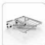
WGB-Z05 Upper level basket frame To load shelf Height adjustable Built-in spray arm H152, W536, D567mm