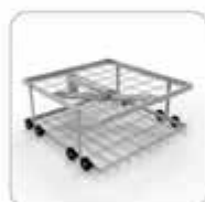
WGB-Z06 Lower level basket frame Double level Built-in spray arm H226, W529, D569mm