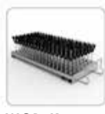
WGB-K90 Injection Module 119 injections Can load 119pcs glass tubes, centrifuge tube, test tubes, sampling vials & so on. Injector nozzle: Ø2.5xH45mm H114xW190xD490mm