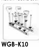
WGB-K10 Injection Module 10 injections For 500-2000ml Erlenmeyer flasks, volumetric flask, measuring cylinder & so on Injector nozzle: Ø6xH220mm H253xW140xD488mm