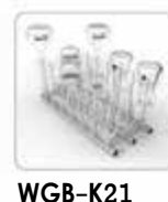
WGB-K21 Injection Module 21 injections For Erlenmeyer flasks, volumetric flask, measuring cylinder & so on Injector nozzle: Ø4xH160mm H183xW192xD488mm