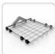
WGB-Z02 Lower level basket frame With two connectors, Used to connect 2 injector inserts Auto self-sealing docking valve H158, W528, D566mm