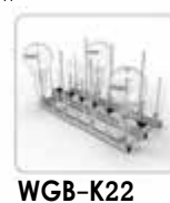
WGB-K22 Injection Module 21 injections For Erlenmeyer flasks, volumetric flask, measuring cylinder & so on Injector nozzle: Ø2.5xH110mm Ø4xH160mm Ø6xH220mm H253xW192xD488mm