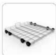
WGB-Z04 Lower level basket frame To load tray and shelf H79, W529, D546mm