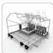
WGB-Z11 Full frame injection module 38 pipettes can be loaded in 3 layers 10 pcs 10-100ml pipette, H550mm 14 pcs 10-25ml pipettes, H500mm 14 pcs 1-10ml pipettes, H500mm H373, W528, D558mm