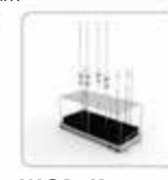
WGB-K91 Injection Module 119 injections Can load 119pcs pipettes, Pipettes' maximum length can be 460mm H189xW190xD485mm