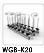
WGB-K20 Injection Module 21 injections For Erlenmeyer flasks, volumetric flask, measuring cylinder & so on Injector nozzle: Ø4xH160mm H253xW192xD488mm