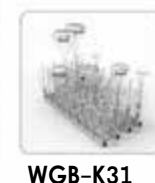
WGB-K31 Injection Module 36 injections For Erlenmeyer flasks, volumetric flask, measuring cylinder & so on Injector nozzle: Ø4xH160mm H164xW204xD511mm