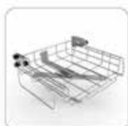
WGB-Z03 Upper level basket frame To load shelf Height adjustable Built-in spray arm H183, W535, D552mm