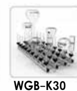
WGB-K30 Injection Module 36 injections For Erlenmeyer flasks, volumetric flask, measuring cylinder & so on Injector nozzle: Ø2.5xH110mm H114xW204xD511mm