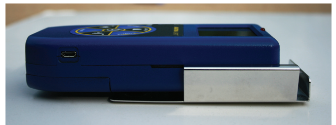
Optional Wipe Test Plate Shown