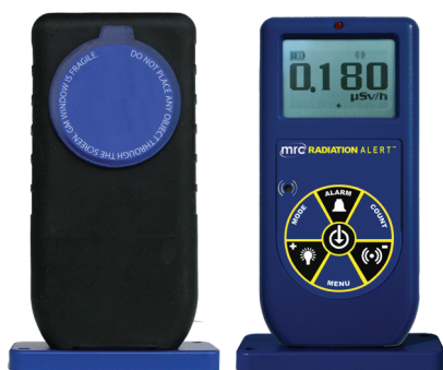
Lanyard, Ruggedized Boot, Detector Cover, USB Cable and Stand Included