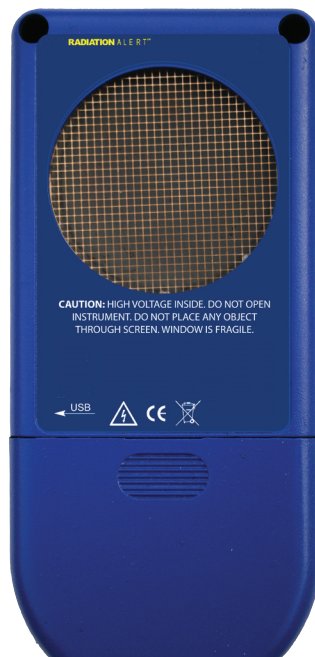
Detector Window and AA Battery Door on Back