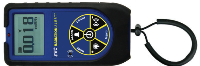
Shown with ruggedized protective boot