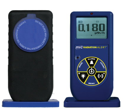
Lanyard, Ruggedized Boot, Detector Cover, USB Cable and Stand Included