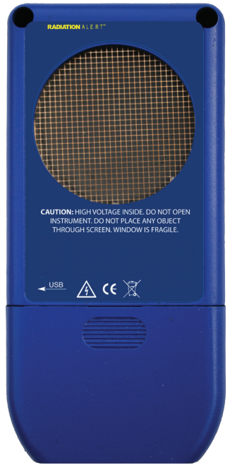
Detector Window and AA Battery Door on Back