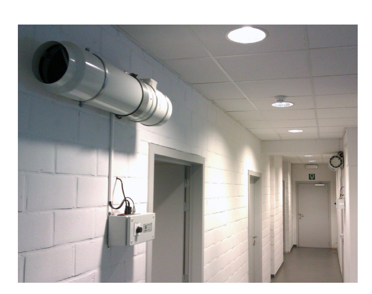
A corridor installation where several Genano® Tube XS air purifiers are used together for optimal results.